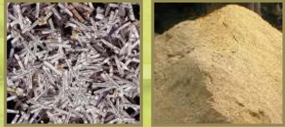
Examples of bedding

There are also various types of bedding to choose from, making it easy to choose the best type of bedding for you and your horse. Kinds of bedding and their pros and cons include: