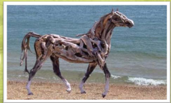
Horse sculpture made of recycled wood