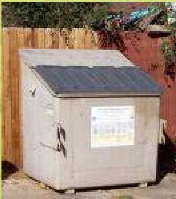
Possible manure storage container