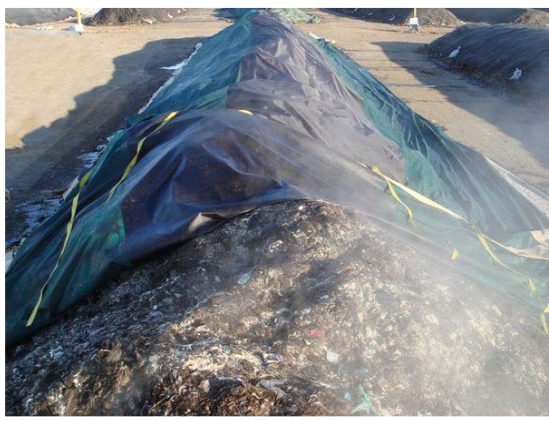
A covered compost pile