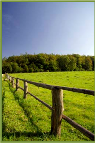
A healthy pasture